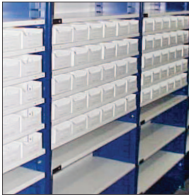
Available Flexi-Bin drawers (dividers optional) are equipped with a backstop that prevents accidental removal.