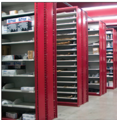
Rows of back to back Flexi-Bins create a highly efficient parts department.