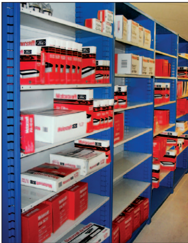
Automotive parts are stored properly in Flexi-Bins, catalog #FB101.