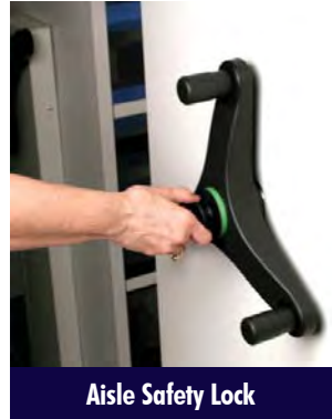
Aisle Safety Lock