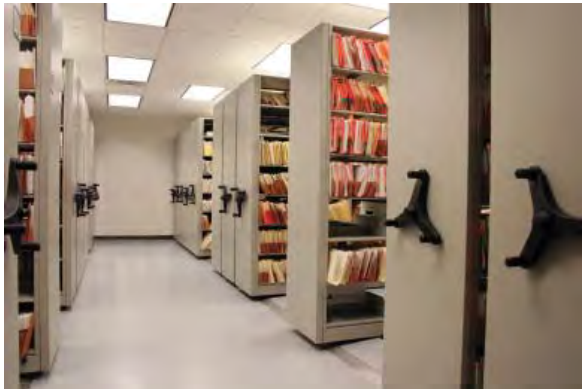
High Density Filing