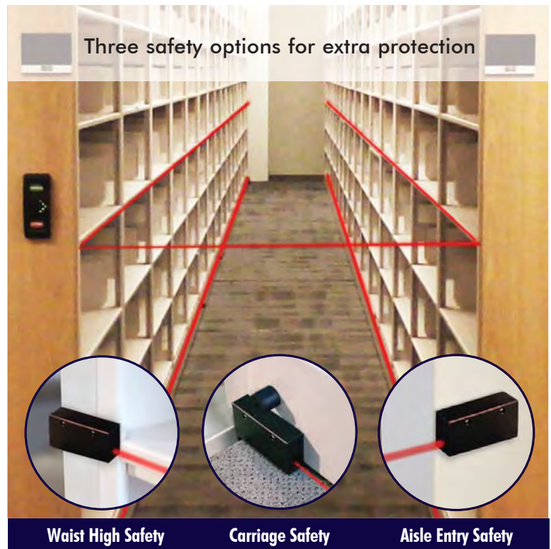
Three safety options for extra protection