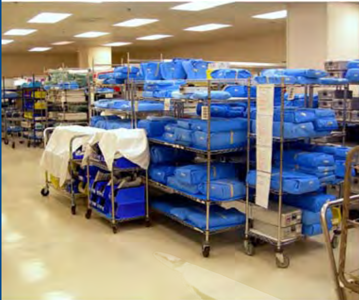
"From a maze..."