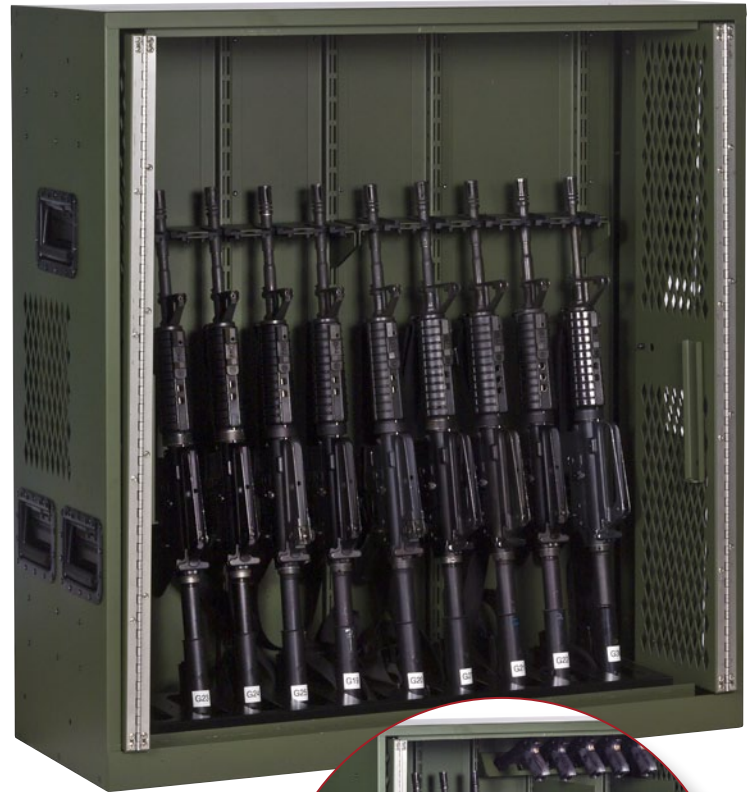
Custom sizes and interior configurations available