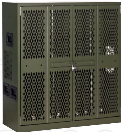
Unit shown is 42 1/4" W x 16" D x 45" H